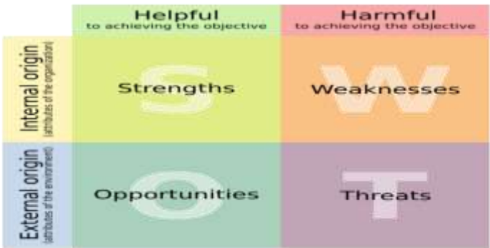
Figure 2.1 SWOT analysis