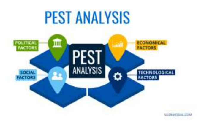
Figure 2.2 PEST analysis

popular for summarizing the political, economic, social, and technological factors. And details were as bellows: