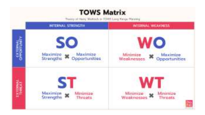
Figure 2.3 TOWS Matrix

https://www.penfill.co/strategy/tows-matrix/